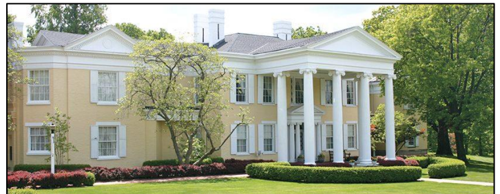
OGLEBAY'S HISTORIC MANSION MUSEUM