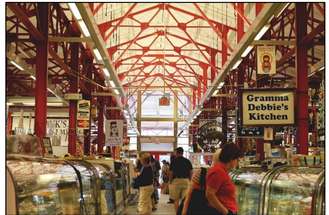
FINDLAY MARKET, CINCINNATI, OHIO

We make our way home today. Breakfast is served at our hotel before departure. Several stops are scheduled for stretch breaks as well as lunch along the way. Arrival to Holland is estimated for early evening, approximately 5:30 PM and back to Caledonia & Grand Rapids around 6:30 & 7:00 PM.