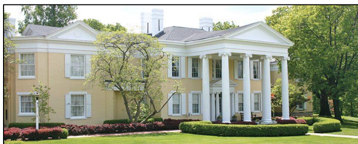
OGLEBAY'S HISTORIC MANSION MUSEUM