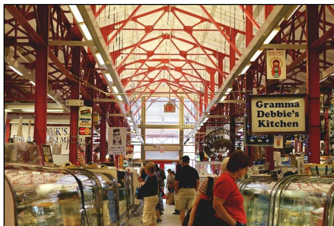
FINDLAY MARKET, CINCINNATI, OHIO

We make our way home today. Breakfast is served at our hotel before departure. Several stops are scheduled for stretch breaks as well as lunch along the way. Arrival to Holland is estimated for early evening, approximately 5:30 PM and back to Caledonia & Grand Rapids around 6:30 & 7:00 PM.