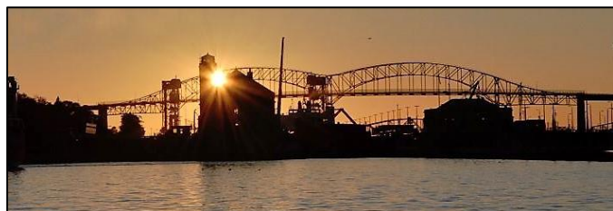
SOO LOCKS, SAULT STE MARIE, MICHIGAN