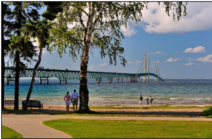
VIEW FROM BRIDGEVIEW PARK IN ST. IGNACE, MICHIGAN

Breakfast is included this morning at the hotel. Before heading home, we stop at Bridgeview Park, the base of the UP’s side of the Mighty Mac. We head across the bridge back to the lower peninsula towards home. Lunch is included on the way home, as well as a stop in Petoskey at Kilwin’s Chocolate Factory. We arrive back in Grand Rapids and then Holland in the early evening. (B & L)