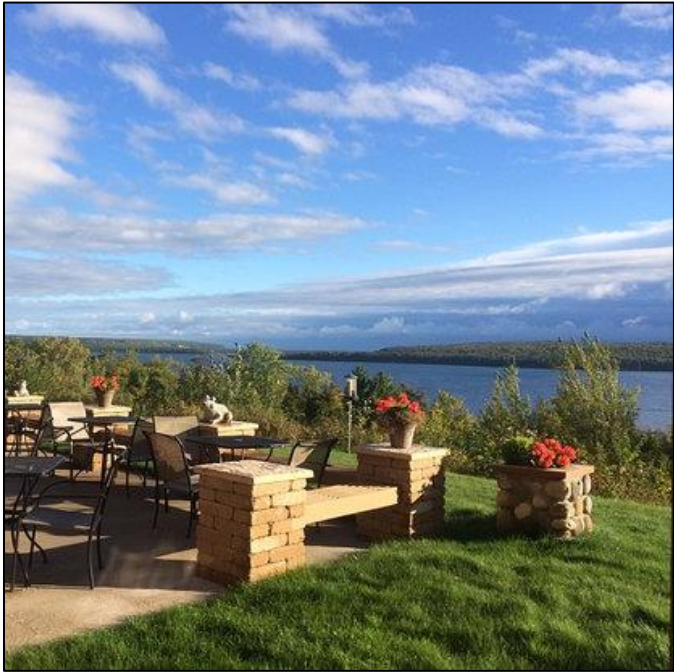
VIEW FROM HOTEL IN MUNISING, MICHIGAN