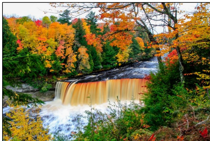
UPPER FALLS AT TAHQUAMENON STATE PARK

With miles of continuous shoreline, acres of beautifully wooded state parks and over 25 waterfalls, touring the Upper Peninsula is surely a must! Departures will be from Evergreen Commons in the Auxiliary Parking lot at 20 th & Central Ave, at 7:00 AM . Second pick-up location is at the AMC Movie Theatre's lower lot at 3000 Alpine Ave NW, Walker, MI 49544 at 8:00 AM . We make a couple of rest stops before crossing the infamous Mackinaw Bridge. Dinner is included tonight aboard the Soo Locks Dinner Cruise! This narrated cruise boards early in the evening and includes a full dinner with narrated history of the locks, cruising amongst all four U.S. Locks, Canadian Lock, St. Mary's Rapids, three hydro-electric plants and historic scenic waterfronts of U.S. and Canada. We head back to our hotel in St. Sault Marie for the night. (D)