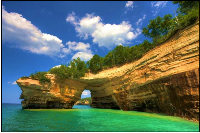
PICTURED ROCKS NATIONAL LAKESHORE

We enjoy a full breakfast this morning at our hotel and then get ready for a morning cruise! We depart the boat dock for a two and a half hour, narrated and guided Lake Superior tour along the Pictured Rocks National Lakeshore! Beautiful sights include the East Channel Lighthouse, Grand Island, Miners Castle, Painted Coves, Caves of All Colors, Lover’s Leap, Rainbow Cave, Indian Head, Gull Rookery, Grand Portal, Battleship Rocks, Flower Vase, Indian Drum, Chapel Cove, Chapel Rock & Spray Falls. A boxed lunch is included today as we head to Palms Book State Park. Kitch-iti-kipi, also known as “The Big Spring”, is Michigan’s largest natural freshwater spring, and one of the most popular attractions in the UP. With its emerald green, pool-like appearance and crystal-clear fresh water, you will be able to see the natural limestone formation of this spring along with vegetation and even some Trout! Next, we head south to see Lake Michigan from the Upper Peninsula’s point of view. A delicious group dinner is included tonight before checking into our hotel located right on Lake Huron. (B, L & D)