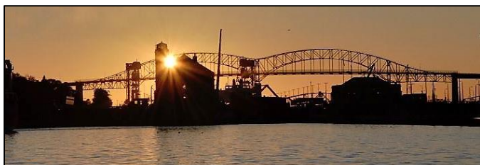
SOO LOCKS, SAULT STE MARIE, MICHIGAN