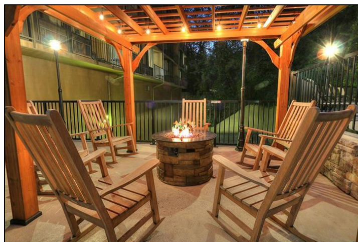
EDGEWATER HOTEL & CONFERENCE CENTER