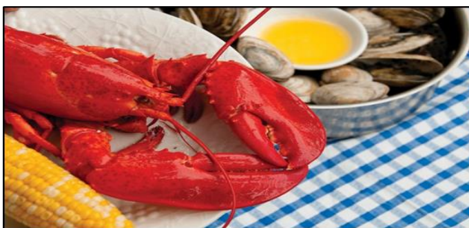
LOBSTER BAKE DINNER

Complete Motor Coach Packages for Individuals, Groups and Charters