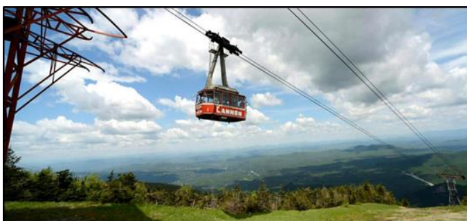
CANNON MOUNTAIN ARIEL TRAMWAY & FRANCONIA NOTCH