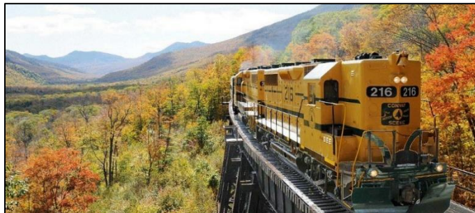
NORTH CONWAY SCENIC RAILROAD

Let's make our way up Cannon Mountain! A cable car will transport us up the 4,080 ft. summit where you can see, on a clear day, the mountains and fall foliage of New Hampshire, Maine, Vermont, New York and Canada. After our descent we board the Conway Scenic Railway's Valley Train to travel 'over the river and through the woods' to Bartlett, New Hampshire. Lunch will be included aboard the train. Our hotel for the evening is in North Conway, NH at The Green Granite Inn. (B & L)