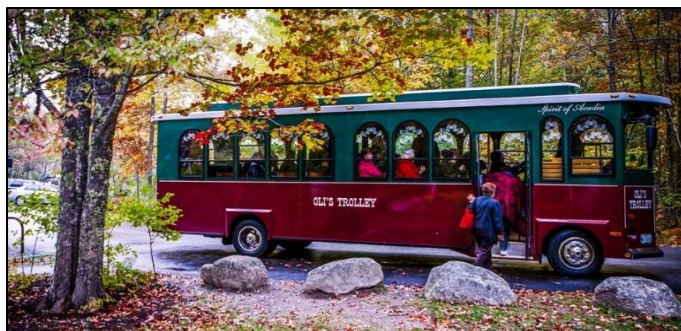
OLI'S TROLLEY TOUR, BAR HARBOR, MAINE

Pack up and head to the coast! We will travel to Bar Harbor, Maine where we spend the next two evenings at the Bar Harbor Regency Hotel. A city tour is scheduled as we take in the history of this coastal town. After the tour, enjoy the rest of the day as you wish. Our tour guide will make suggestions on where to go and what to explore! A delicious lobster bake dinner is scheduled this evening at the hotel. (B & D)