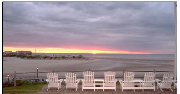
VIEW FROM SEA CHAMBERS, OGUNQUIT, MAINE