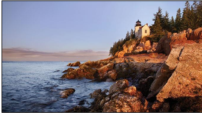
ACADIA NATIONAL PARK

Once finished with our breakfast at the hotel, the morning is free to explore Bar Harbor, Maine. Later, we head to Acadia National Park. We will tour America's oldest National Park east of the Mississippi River! Inside the park we will visit Cadillac Mountain, Thunder Hole, Sieur de Monts Spring and many more picturesque sites! (B)