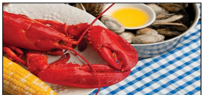
LOBSTER BAKE DINNER

Complete Motor Coach Packages for Individuals, Groups and Charters