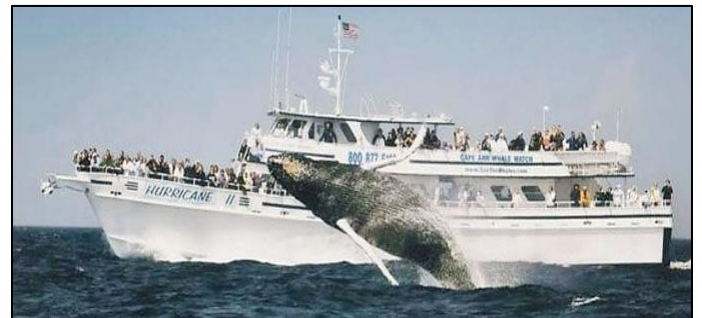
CAPE ANN WHALE WATCHING