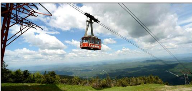
CANNON MOUNTAIN ARIEL TRAMWAY & FRANCONIA NOTCH