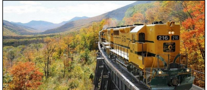
NORTH CONWAY SCENIC RAILROAD

Let's make our way up Cannon Mountain! A cable car will transport us up the 4,080 ft. summit where you can see, on a clear day, the mountains and fall foliage of New Hampshire, Maine, Vermont, New York and Canada. After our descent we board the Conway Scenic Railway's Valley Train to travel 'over the river and through the woods' to Bartlett, New Hampshire. Lunch will be included aboard the train. Our hotel for the evening is in North Conway, NH at The Green Granite Inn. (B & L)