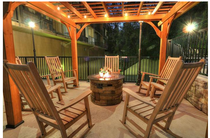
EDGEWATER HOTEL & CONFERENCE CENTER